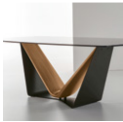
0110 NERO 8242 CORTEN SPAZZOLATO