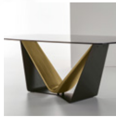
0110 NERO 8241 BRONZO SPAZZOLATO