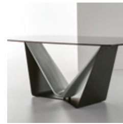
0110 NERO 8240 ARGENTO SPAZZOLATO